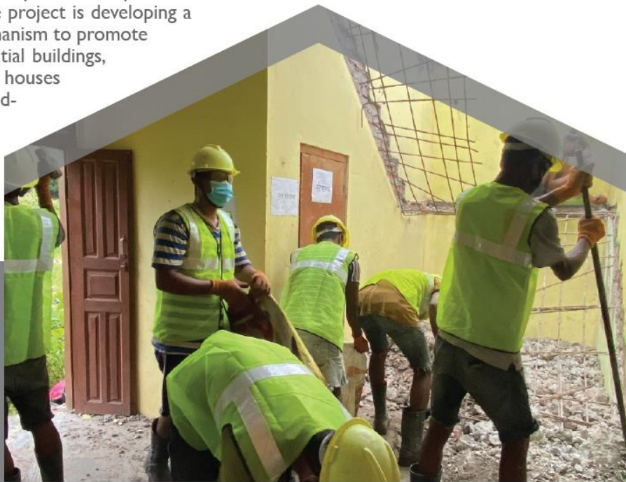
Mason trainees who completed on-the-job training developed by USAID's Baliyo Ghar program on retrofitting construction practices put their new skills to use under a Tayar Nepal grant on seismic retrofitting of residential buildings led by NSET in Tulsipur and Ghorahi Sub-Metropolitan cities.