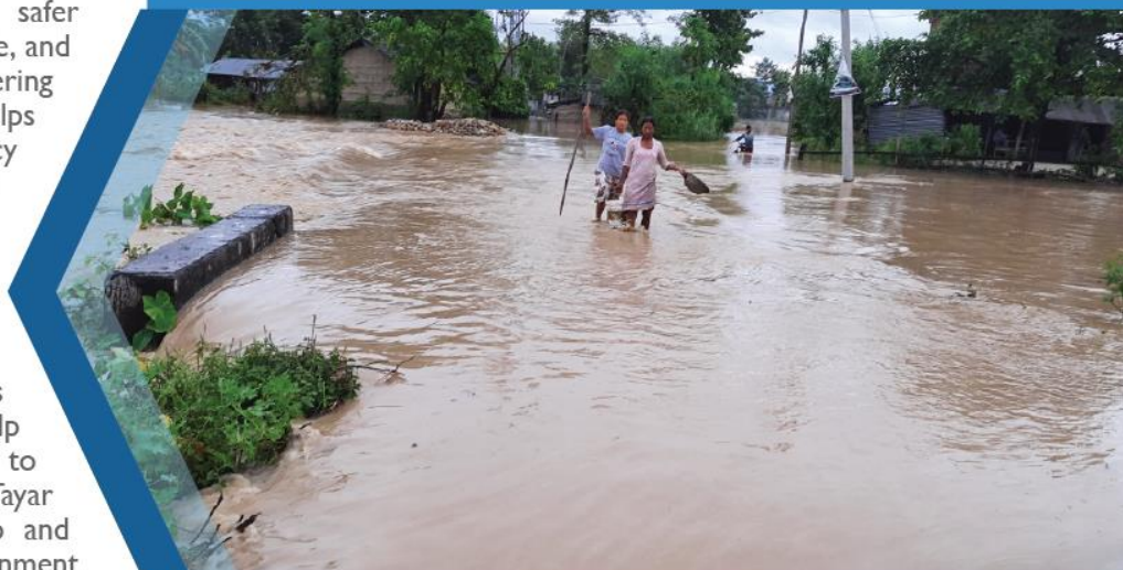
People evacuating from their homes from the recent flood in Rajapur, Ward 1, to find shelter in Daulatpur School.