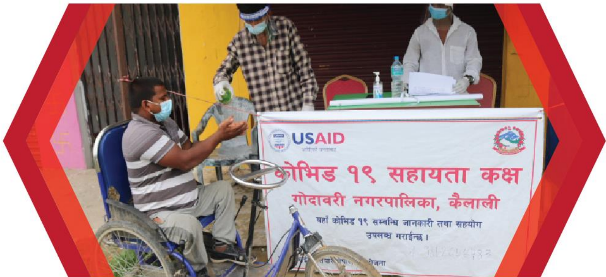
Volunteers at the Godawari Municipality COVID-19 help desk provide sanitizer to a disabled person before checking his temperature. Tayar Nepal helped activate helpdesks and mobilize volunteers across its partner municipalities.

At the peak of the COVID-19 crisis, municipalities saw a huge influx of migrant workers from India. Tayar Nepal's partner municipalities were among the hardest hit, and they requested support ensuring a basic standard of quality, sanitation, and safety at their quarantine and health centers. Tayar Nepal completed a rapid assessment and identified specific items needed in the quarantine centers to improve their current standards. The project then supported municipalities in their COVID-19 response by providing safety materials, mobilizing volunteers in isolation centers and health centers, raising awareness and managing the flow of COVID-19 information; and re-activating helpdesks to disseminate key information in communities.