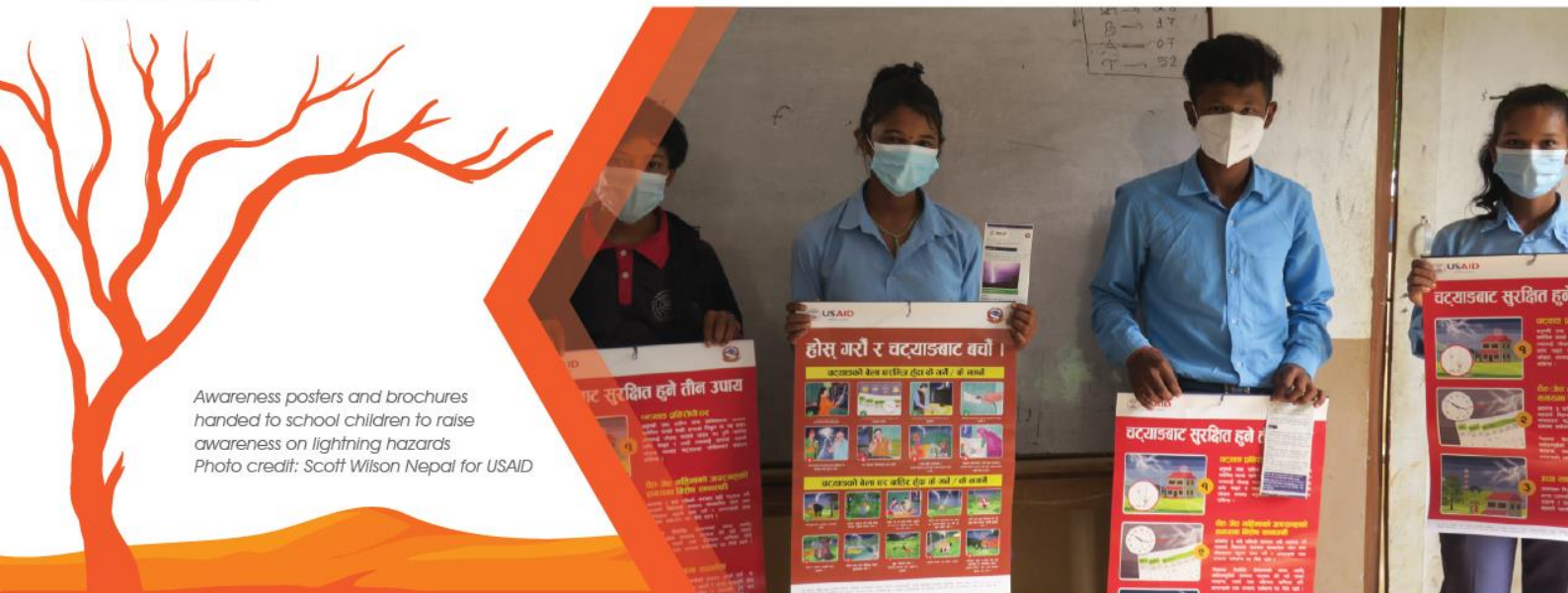
Awareness posters and brochures handed to school children to raise awareness on lightning hazards

Based on learnings from the lightning technology demonstrations, Neelakantha Municipality plans to replicate the same in other public and private buildings and to share learnings in twin municipalities. To mitigate drought hazard, Tayar Nepal will provide training to farmers on drought-resistant seed production technologies and will develop agriculture index insurance products to help protect farmers from weather and climate-related losses. Lastly, Tayar Nepal will continue to help municipalities mitigate fire risk by raising their awareness and capacity to prevent and manage fires through practical trainings and drills.